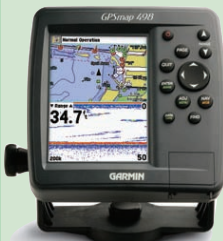
Chart Your Course

This rugged, waterproof chartplotter comes preloaded with BlueChart® g2 data for the U.S. coast, including Alaska and Hawaii. This detailed map data includes 3D maps, tide and current data, improved IALA symbols, nav aids, marinas, boat ramps, coastal roads and more. There's even a database of aerial photos, detailed roads and points of interest that you can reference for "real picture" views of harbors and marinas. The 498 can also accept preloaded data cards for additional map coverage.